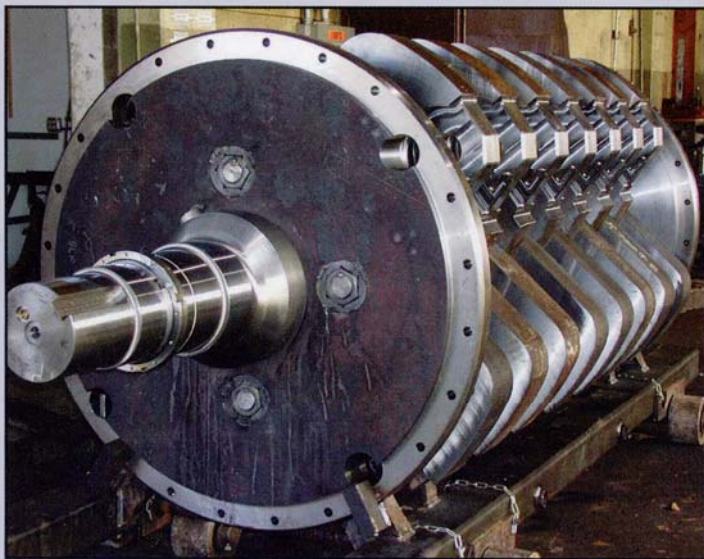
Spyder rotor that uses 23176K bearing

Large Selection of Upper and Lower Feed Roll Bearings and Main Rotor Bearings Including the Popular 14" and 18" Rotor Shaft Sizes