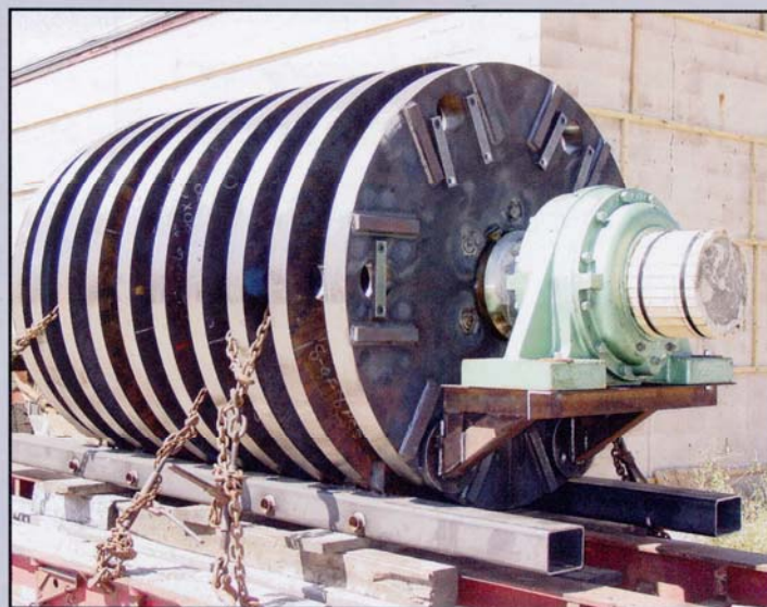
Disc rotor that uses 23192K bearing